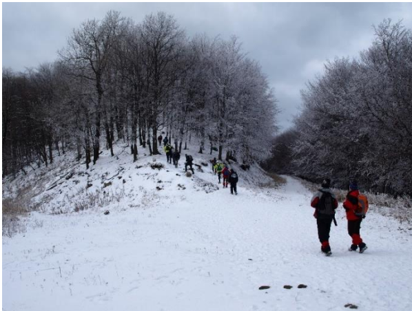
Picture 3. The saddle of the Sötét-lápa in winter (during the Téli Mátra performance tour).

We arrive at Mátraháza at the yellow and yellow cross signs. We continue our journey on the yellow, blue and red signs, and then only on the blue and red signs to the Vörösmarty tourist house. Here we choose the red cross sign, which we follow to Pisztrángos Lake. From here we turn to the ascent towards Kékes. The blue cross sign leads through the place called Gabi's death (where a cartman named Gabi once fell into the deep with the cart) to the saddle of the Sötét-lápa. Leaving the saddle of Sötét-lápa (pic. 3), our path becomes steeper and we reach Kékestető.