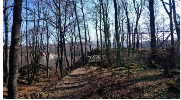
Picture 2. Kecské-bérc and the Mátra Health Resort in summer and late autumn